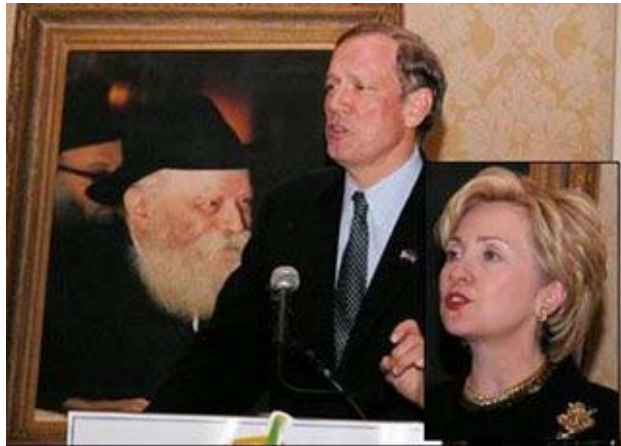
Governor of New York, George Pataki

...Giving a speech at a Lubavitcher "Award" Ceremony (That's The "Rebbe" [i.e. Rabbi Schneerson: Former Leader of the extremist Lubavitch Movement] in the painting behind him).